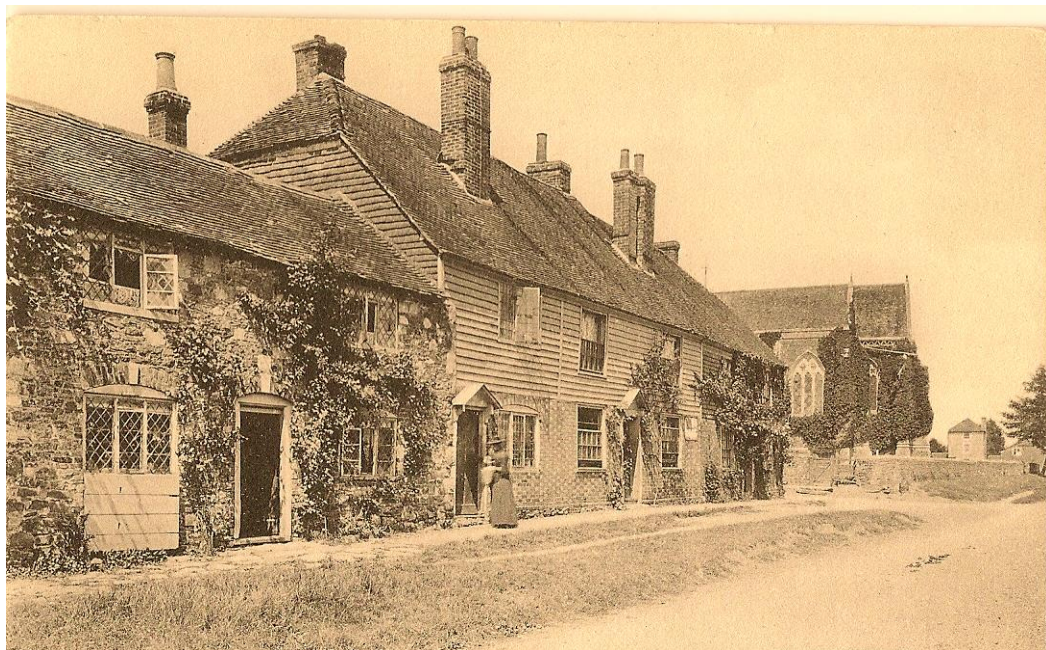
Friars Road Winchelsea